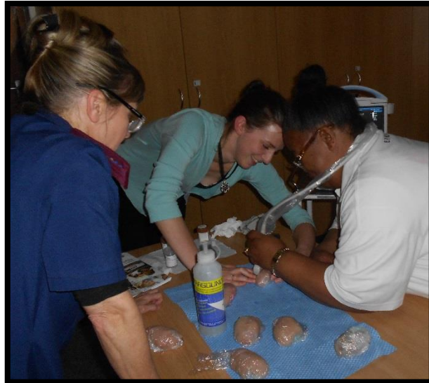
Students in PE having the chance to try the biopsy technique they have learnt