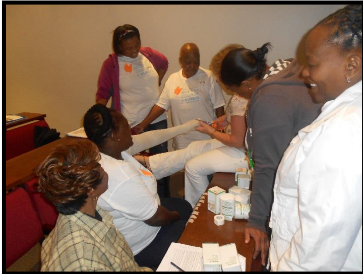
Students in Johannesburg learning to do lymphoedema bandaging