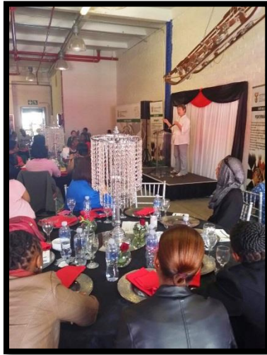
The DEA women's breakfast

Read more here: http://www.jennyedge.co.za/2014/10/womens-month-celebration-at-department.html