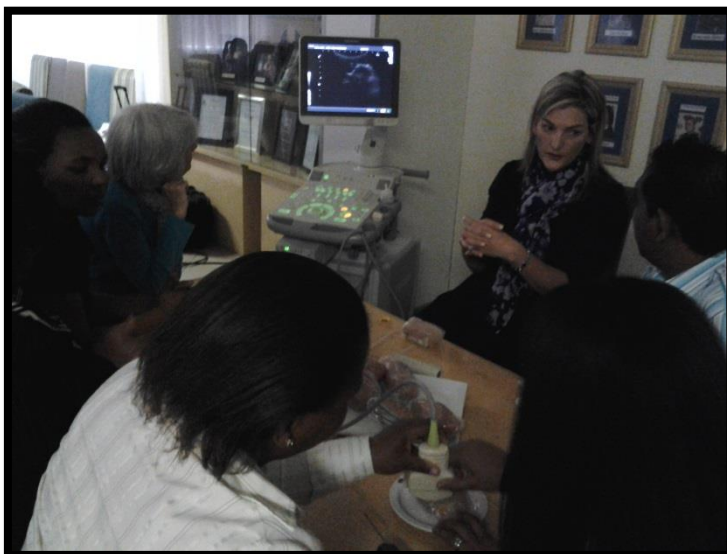
Durban students learning about biopsy techniques