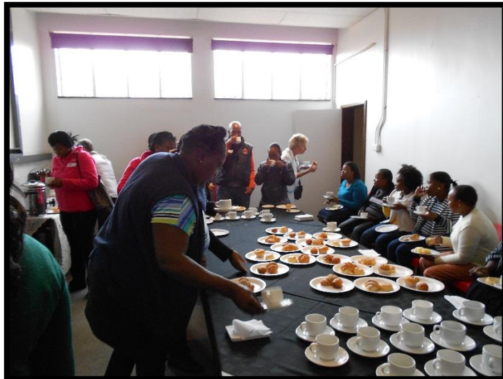
The food and snacks are always welcome during the busy practical days!