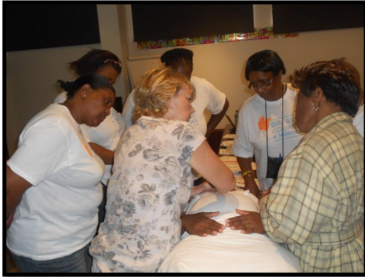
Lymph drainage techniques with the Johannesburg students