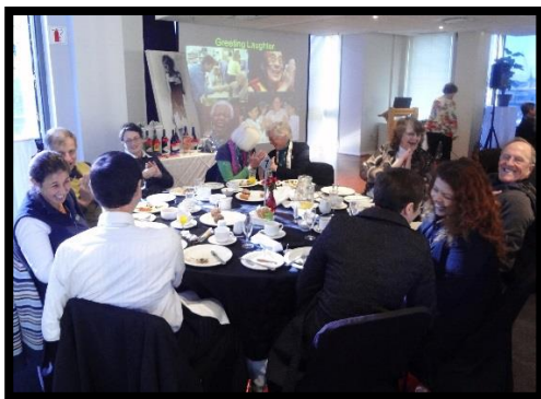
Breakfast fundraiser laughs: practising laughter yoga!