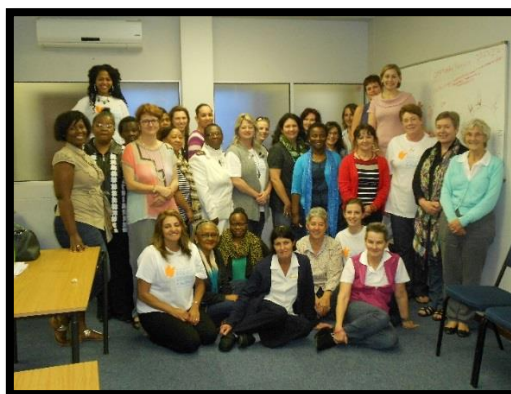
Port Elizabeth group: November 2014