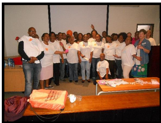
Johannesburg group: March 2014

Cape Town: we commenced a Cape Town course at the Christiaan Barnard Memorial Hospital in July and this course will end in early 2015.