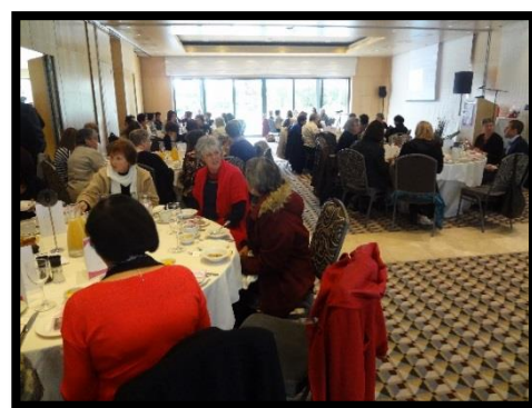
The topic of the talk at the PLWC breakfast

Read more here: http://www.jennyedge.co.za/2014/08/plwc.html